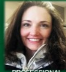
PROFESSIONAL DEVELOPMENT COORDINATOR